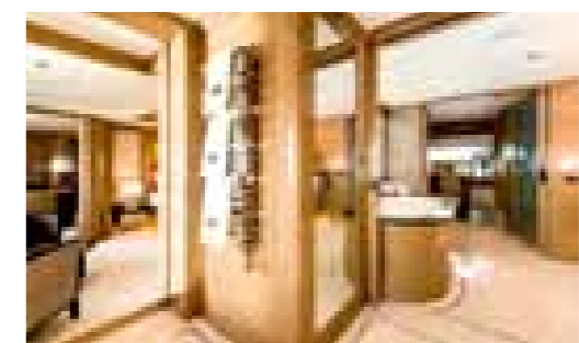
Above: Service and storage units either side of the salon create a visual pause between the dining and seating areas in the main salon.