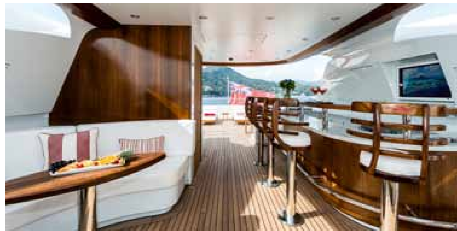
Above: From hot-tub to bar and sunbathing – Atomic ’s sundeck is all about options. Left: A TV in the shaded bar area is a sociable place for guests to gather. Facing page, top: Raised sunpads either side of the hot-tub. Facing page, left: The forward part of the sundeck is the prime place to be.