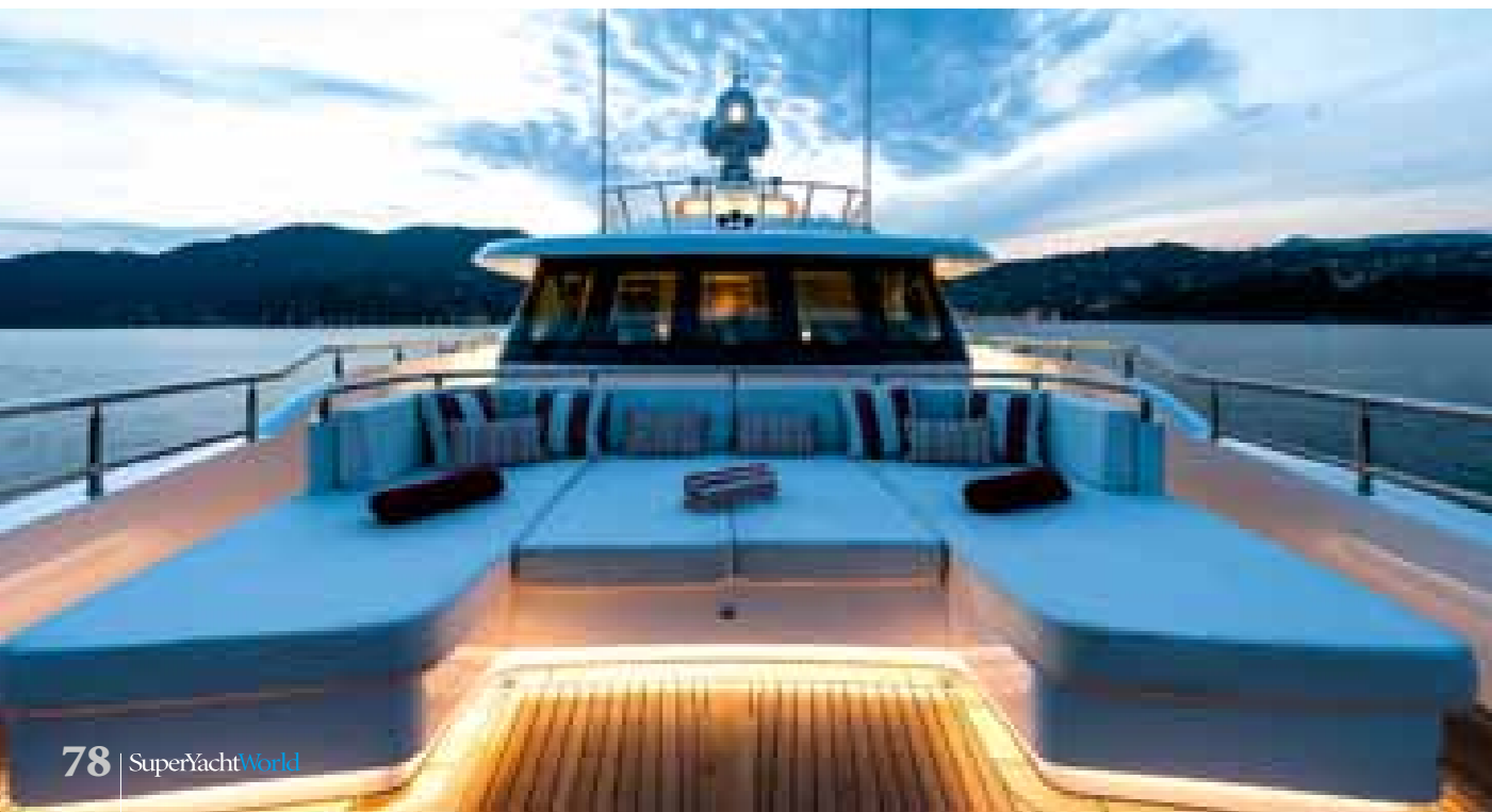
Above: The décor in the bridge deck lounge reflects the cool and contemporary feeling throughout. A large-screen TV comes out of the cabinet to port. The sofas and chairs throughout were designed by Franck Darnet and made by ZET Decoration. Right: A bar area ensures the lounge is a key space in which guests can gather in the evening. Facing page, top: Artworks selected by the owner add a colourful accent to the space. Left: The forward seating area is proving a popular spot with the yacht's owner.