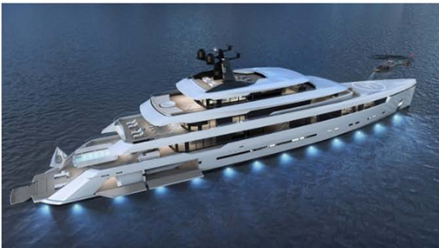
The six deck yacht features a steel hull and aluminium superstructure

Darnet has penned both the exterior and interior design and partnered with broker Thompson Westwood White to present the concept. The six-deck yacht features a steel hull and aluminium superstructure with “elegant and tight lines”.