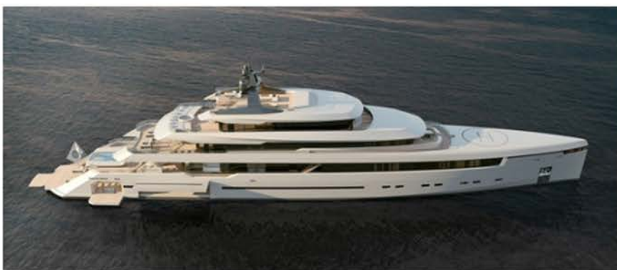
14 guests can be accommodated on board Starlight

The crew quarters can be found on the lower deck and include accommodation, the galley, crew mess and crew lounge. A crew gym, extra storage and laundry facilities sit below on the tank deck.