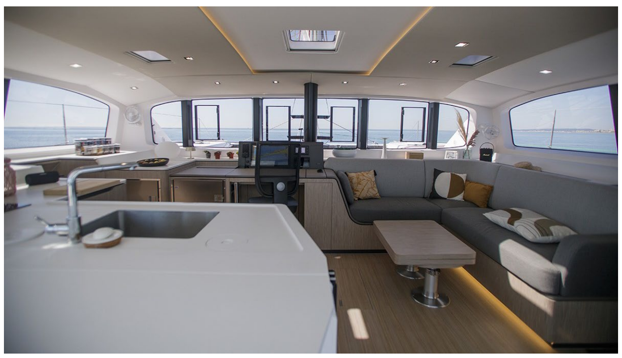
OUTREMER 52

in the design department at Renault. He also has the end product in mind in terms of its shape, functionality and perceived quality. His experience pulls us upwards. It sometimes forces us to question ourselves. And that's very stimulating!