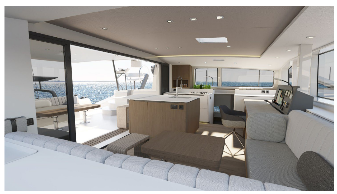
OUTREMER 55