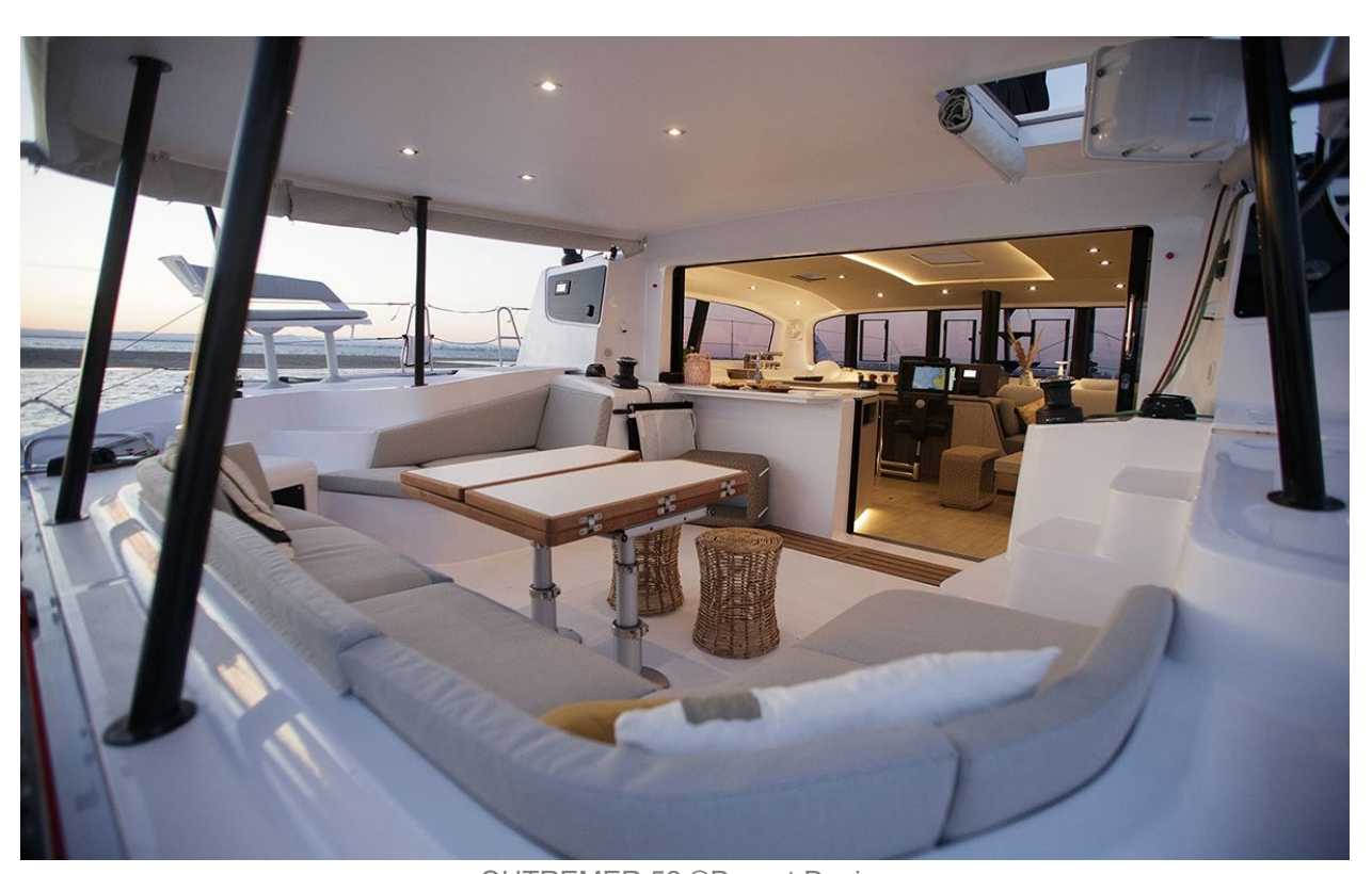
OUTREMER 52