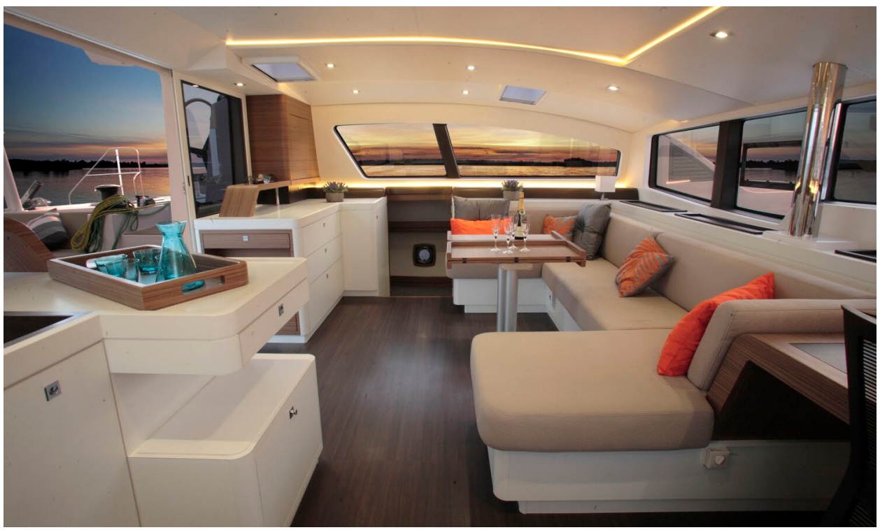
OUTREMER 5X