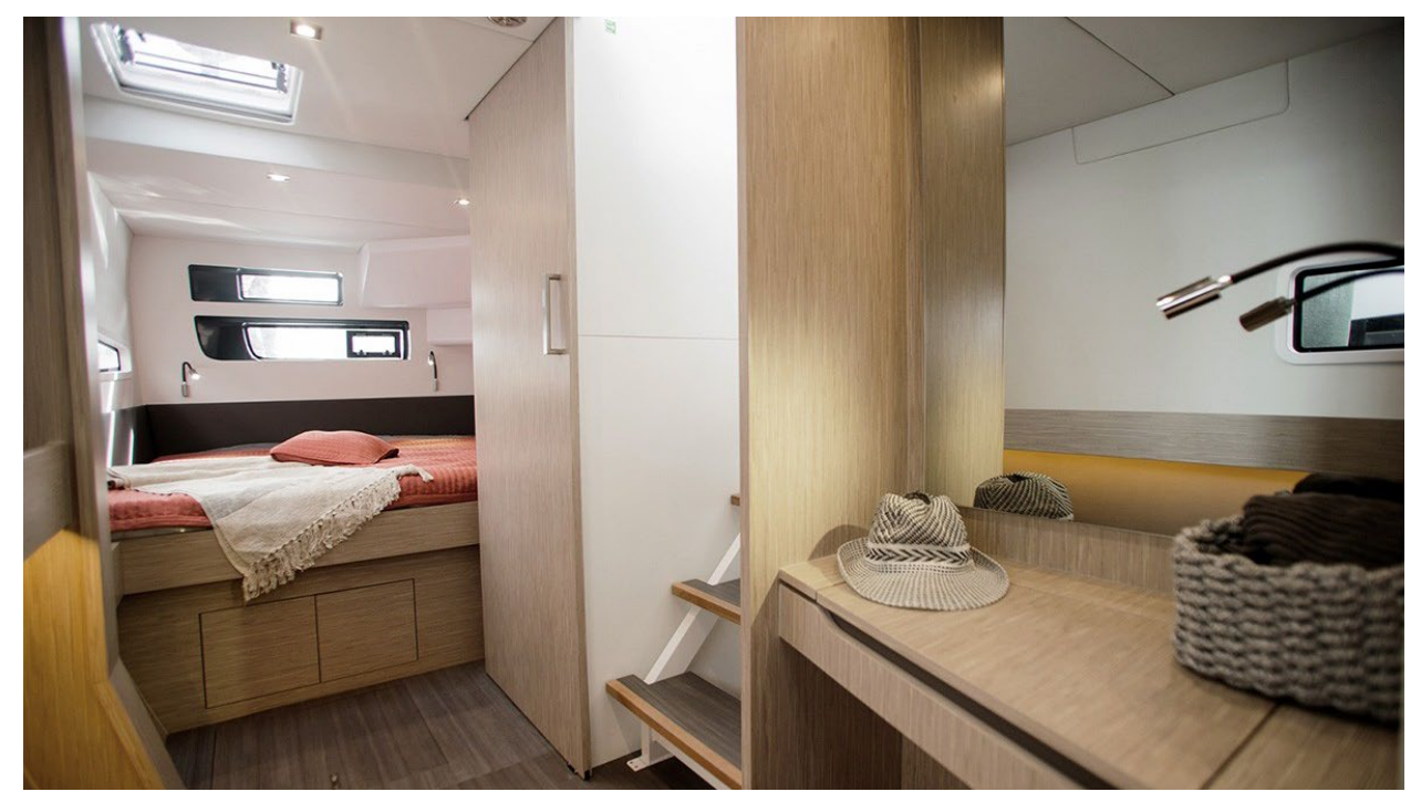
OUTREMER 55

You were project manager for the Outremer 55 and 52. Both these boats, like their predecessors, were voted European Yacht of the Year. How do you explain this exceptional success?