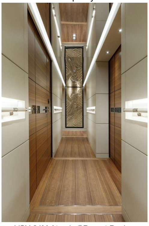
VSY 64M Atomic ©Darnet Design

Yes, absolutely. First off, there was the 64-metre Atomic , which took 3 years to complete, with many trips back and forth to the Viareggio yard in Italy, where all the spaces had to be designed in 3-dimensions down to the millimetre and where many different people had to work on site. On that type of major project, the demand for final quality is immeasurable.