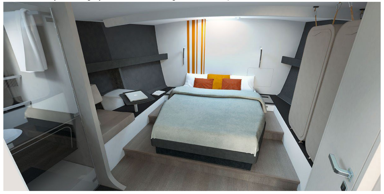
Black Pepper Code 2 ©Darnet Design

In a completely different vein, I really liked the Explocat 52 catamaran, working with the wonderful team at Garcia who are also passionate about their sailing boats, so communication was very easy. And then there have been some the more original projects, such as the Black Pepper Code 2 and the Kayflô, a highly innovative floating home concept.